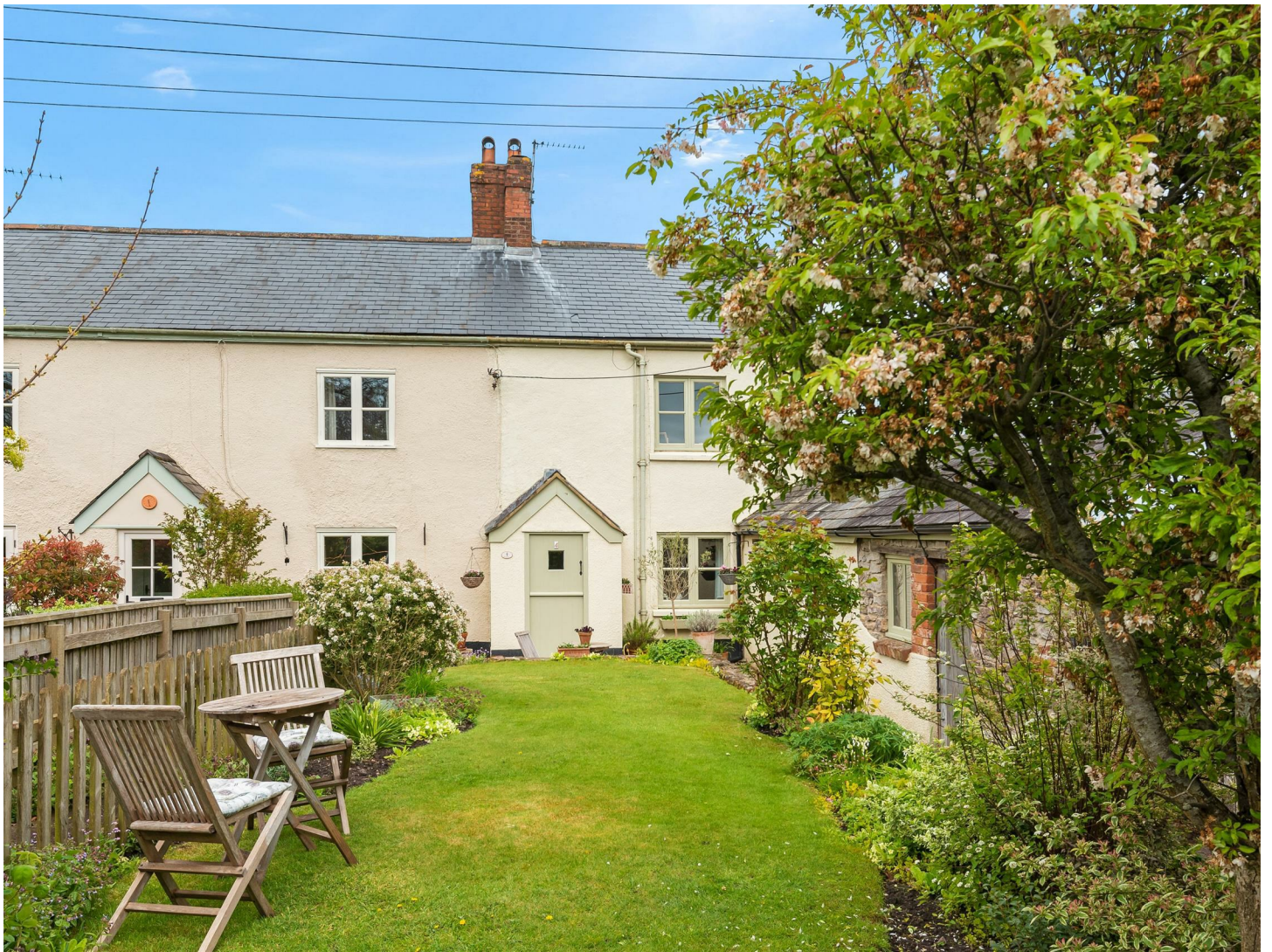
4 Redgate Cottages